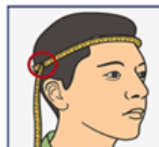
1. head circumference