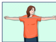
2. arm span