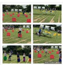
Dates for the Summer Term