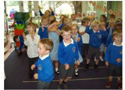
Wake & Shake